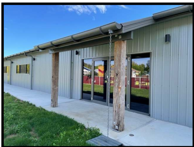
Walcha's NEW Community Gym